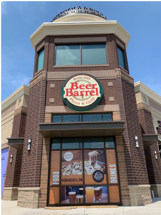
Left: entrance to New Beer Barrel Dublin Green